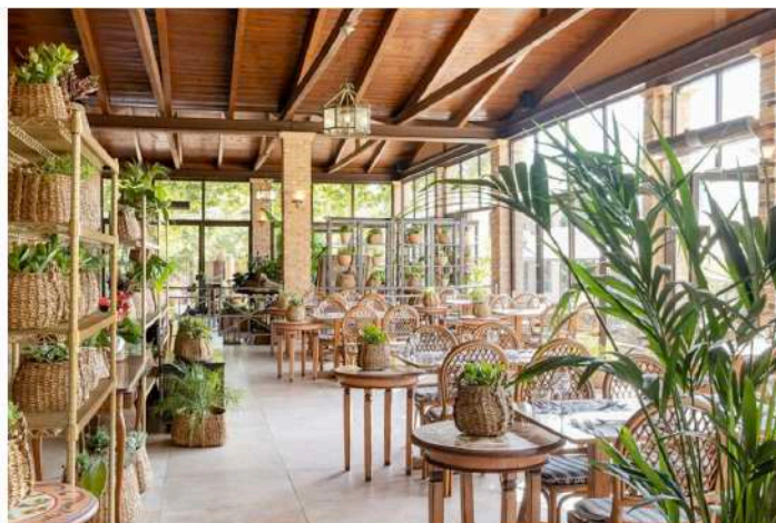
The buffet restaurant is a rustic dream

Breakfast options include every style of yoghurt you could possibly imagine, fresh fruit, eggs in all their guises, pastries, meats, cheeses and pancakes. Lunch is a similar affair with a plethora of salads, cheeses, meats and hot dishes reigning supreme.