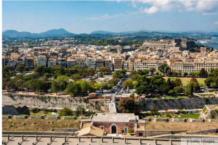
A view of Corfu Old Town from the Old Fortress

We marvelled at the Old Fortress, paid a visit to the Holy Church of Saint Spyridon and sussed out some of the city's quaintest corners.