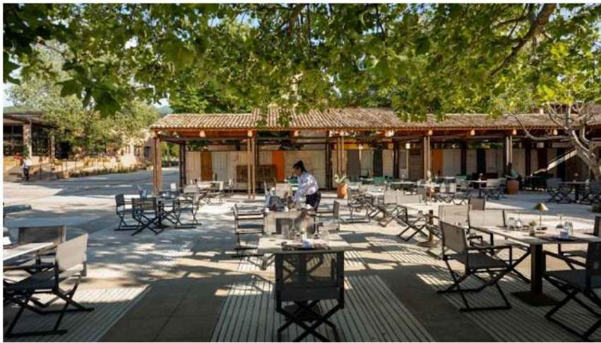
The fine dining restaurant is located outside in the hotel's 'piazza'

The jewel in the crown is The Botanika: the hotel's fine dining flagship restaurant. Think elevated, seasonal dishes jam-packed with delicious local produce. The chic spot now also features a new 'lobsteria' to satisfy all your lobster cravings.