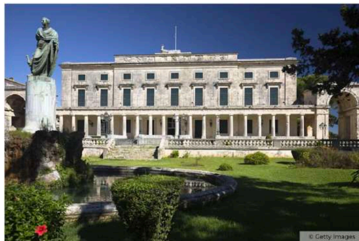
The Palace of St Michael and St George in Corfu Old Town

Run by X Adventure Club, the tour (€110 per person), lasts approximately six hours and takes guests on a picturesque journey around some of the island's gems, including Sven's house in The Durrells, Corfu Beer's microbrewery in Arillas, Enotis (a family-run olive oil grove and museum), lunch at a cliffside restaurant overlooking Arillas Bay, and a glimpse of Cape Drastis in all its jagged glory.