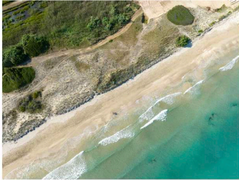
The sparkling Ionian sea lies just beyond the hotel

Their Corfu outpost notably combines Greek tradition with modernity, offering guests the very best of both worlds.