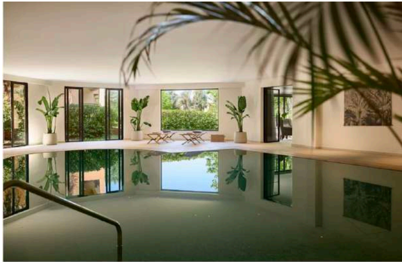
Guests can recharge and unwind in the beautifully serene spa

Expect all the usual trappings of a five-star hotel, including a mini bar, daily fruit platters, a safe, dressing gown and slippers and a nightly turn-down service.